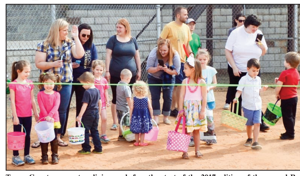
Towns County youngsters lining up before the start of the 2017 edition of the annual Rec Department Easter Egg Hunt. Canceled in 2020, the hunt returns Saturday.

Community safety amid the coronavirus has been the top See Egg Hunt, Page 6A